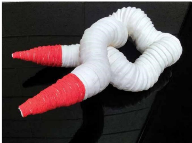
Figure 27: Retrospection & Prodigy Series #8, 2012, Porcelain, 20.5cm x 55cm x 31cm

Flute from coconut leaf is the inspiration behind the artwork featured above. It was made to be abstract in three-dimensional (3D) form through interwoven, consistent lines. In Mohd Khairi Baharom artist statement, it is stated that this artwork symbolized children's creativity to create their own toys in the past, to compensate for their inability to buy expensive modern toys. Toys which were made from natural materials were impactful to the artists since they were a form of innovation among the children as they immensely enjoyed themselves playing with them.