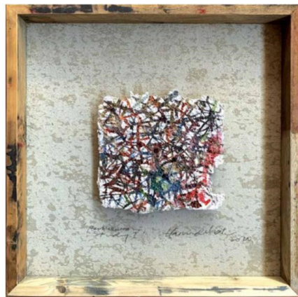
Figure 24: Permukaan; Study 1 , 2020, Recyclable materials, paper, wood, and cement board, 51cm x 51cm

In this category, the artwork was selected based on the use of visible and direct element of art. It provided an ease of comprehension as the artwork did not lead to any issue. Based on his or her experience, the artist provided created an element of art in the artwork: it is formed through the elements and principles of art as well as emphasized on the aesthetics of art in general. The artwork selected from SI+SA Exhibition for this category was an art piece by Hamidi Hadi, entitled Permukaan; Study 1 .