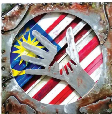
Figure 26: Malaysian Helping Hands, 2020, Aluminium, 61cm x 61cm

For the social category, an artwork by Aznan Omar (2020) entitled Malaysian Helping Hands, was chosen based on its visual and the artist statement which was comprehensible and representative of the Malaysian characteristics in general.