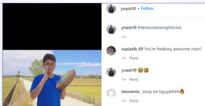
'How to play kompang' by the first-place winner for university category.

As for the Demonstrative Video Competition, 16 students submitted their videos demonstrating various interesting skills and topics. The participants were very creative in terms of editing and delivery, from demonstrations as easy as 'how to tie a necktie' to unique demonstrations such as on 'how to do the worm dance'.