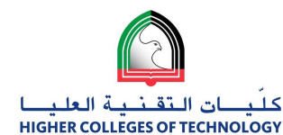
United Arab Emirates