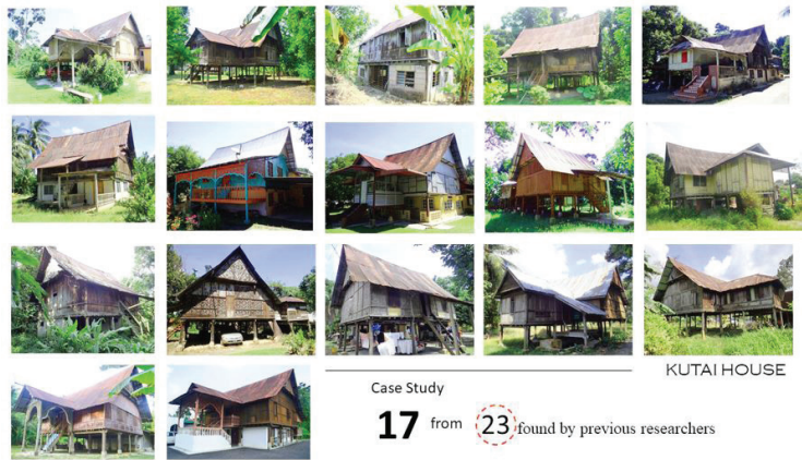
Figure 2. The Traditional Malay Houses (Kutai type) which are used as Case Studies