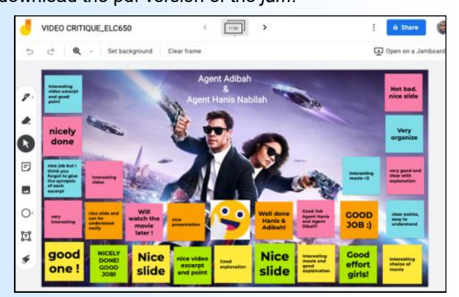
An example of peer-assessment for video critique assessment

Jamboard, a digital whiteboard provided by Google offers an interactive canvas that enables collaboration. Apart from using a jamboard as a digital whiteboard (a good teaching aid besides slideshow and talking in online classroom), you can do a lot more with a jamboard such as drop images, and add notes, among others. As an initiative to promote learning in my classroom, I employed a formative assessment, namely peer-assessment to enhance my students' learning. They are required to work collaboratively by joining the jamboard and use the sticky notes feature to assess and offer feedback to their friends' presentations. Notably, some students provided their honest feedback and I noticed students can comment and offer quality feedback. This may be due to the anonymity in the jamboard, which made students comfortable in providing feedback to their friends. Students were psyched when jamboard was initially introduced to them but over time they enjoyed all the jamboard sessions. In fact, at the end of every session, As a collaborative tool, I use jamboard for students to work they were so excited to have a copy of the jamboard . This in groups and offer their insights such as having a brainis another great feature of jamboard, in which you can download the pdf version of the jam.