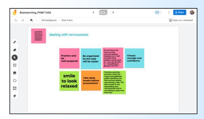
An example of brainstorming session via jamboard

storm session. Personally, I enjoyed using jamboard when assigning group tasks as I can monitor the students while they complete the group tasks in my online classes. Given almost two years of online teaching experience, it is my conviction that Jamboard is an efficient and a user-friendly tool to be used in online classrooms to promote collaboration as well as having variation in the teaching and learning process. Indeed, I will definitely jam my classroom with a jamboard!