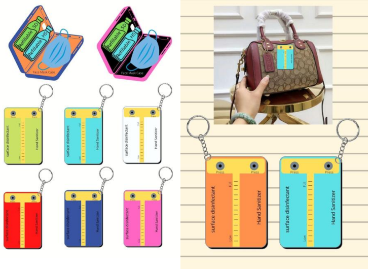
Figure 2. Multiple choice of color and natural fragrance

SMART Hygiene kit combines multiple products into one complete and convenient product, the combination of hand sanitizer, face mask protector and surface disinfectant makes it perfect for everyone to own it. SMART Hygiene Kit is eco-friendly because it has a refillable container and it is economical. It is also made from biodegradable plastic, which is not only durable but also safe for the environment.