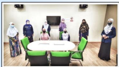
The organising committee