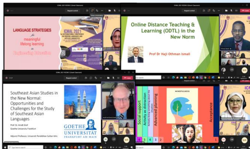
Keynote and Plenary sessions

All speakers, presenters, and participants were pleased with the conference. With the positive feedback given, apparently, it has achieved its objective as an avenue for the sharing of knowledge and discussion on different aspects of languages. Language is a tool that helps to operate the world and keeps us evolving. It remains relevant in the past, present, and in the future. Congratulations to all the conference organisers, presenters, and participants. With everyone's commitment, the conference was a success. Alhamdulillah!