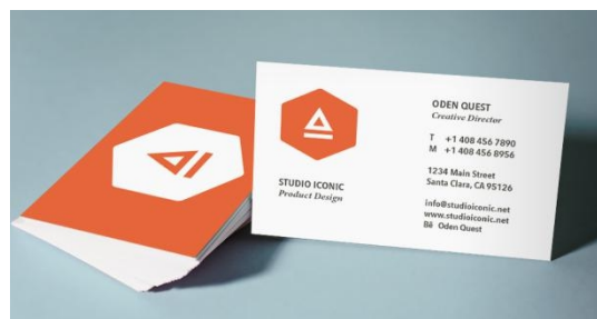
Examples of Business card Design

Our company, RulFar_23 is a services and product that making a business card for company employees. Our products that is business card that making by template and design from customers want.