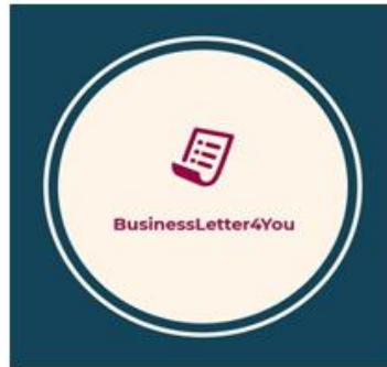
Figure 1. Project Logo

In brief, the “ www.BusinessLetter4You.com ” website consists of 6 components, which are:- Home, 2. About, 3. Business Letters, 4. Services, 5. How Do I Work, and 6. Contact. Firstly, The “Business Letters” section contains the posts for each type of business letters as the main attraction of the website. Next, each post contains the description, elements, tips, format and samples for a certain type of business letter. Here are the descriptions and illustrations: