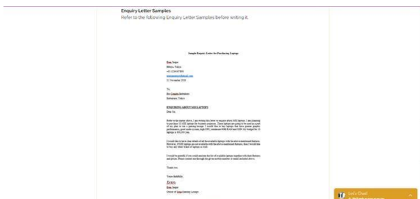
Figure 4. Sample for Letter of Enquiry

www.BusinessLetter4You.com is designed to become a user-friendly website which highlights comprehensive and clear-cut essential characteristics, such as mobile compatibility, well-formatted content, effective navigation and attractive web design.