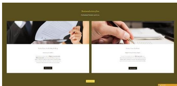
Figure 5. The “Services” section on www.BusinessLetter4You.com website

Another main appeal of “ www.BusinessLetter4You.com ” is the proofreading and translation services in the “Services” section of the website. These services serve as an entrepreneurial opportunity by providing proofreading and translation services from English-Malay and Malay-English specifically for business letters. This platform would be able to generate income and entrepreneurial opportunities to professional student graduates who wish to get networking and business exposure.