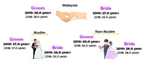
Figure 1: Median age at marriage by sex, Malaysia, 2018 and 2019

According to the study that is conducted by Mahidin (2020), marriages dropped by 1.2 percent, from 206,352 in 2018 to 203,821 in 2019. As a result, the CMR decreased from 6.4 per thousand people in 2018 to 6.3 in 2019. The number of Muslim weddings registered in 2019 was 147,847, a reduction of 1.5% from 150,098 in 2018. CMR dropped from 7.6 per thousand Muslim population in 2018 to 7.4 in 2019. Non-Muslim weddings also decreased by 0.5 percent, from 56,254 in 2018 to 55,974 in 2019. As a result, the CMR decreased from 4.5 per thousand non-Muslims in 2018 to 4.4 in 2019.