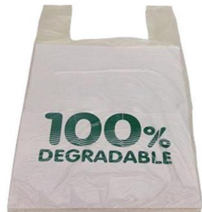
Figure 5.4: Sustainable Container and Plastic Bag Charged by FiVsh company