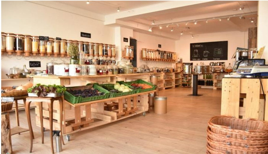
Figure 5.3: Zero-Waste Store that Available in Kuala Lumpur and Selangor