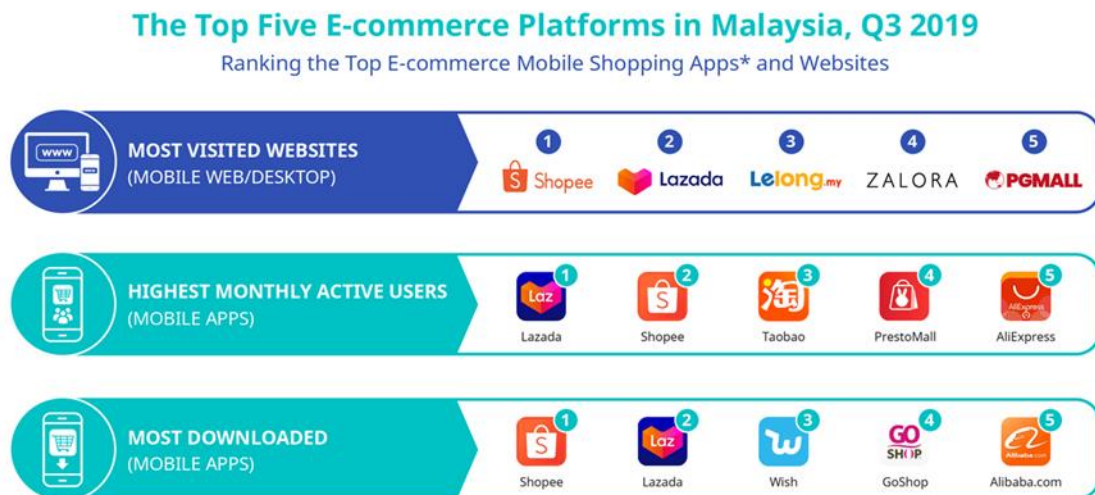
Figure 5.2: The Top Five Malaysia E-Commerce Platforms in Year 2019