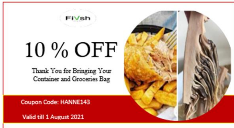
Figure 5.1: A Discount Coupon Offered by Fivsh company