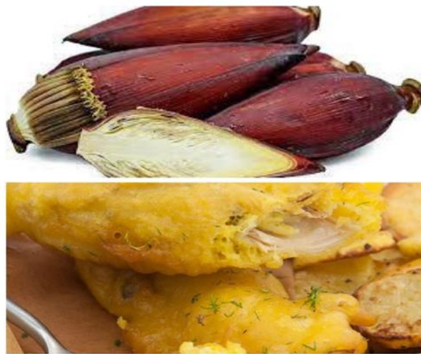
Figure 5.5: Banana Blossoms and Example of Finished Product by FiVsh company