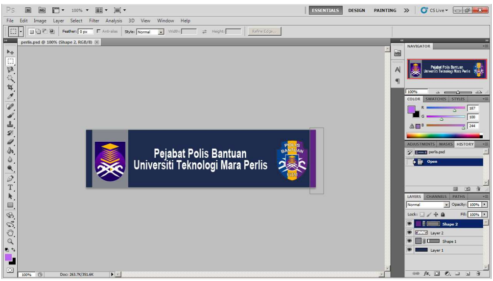
Figure 1: Banner of UiTMNFC

Journal of Computing Research & Innovation (JCRINN) Vol 3, No 2 (2018) eISSN 2600-8793