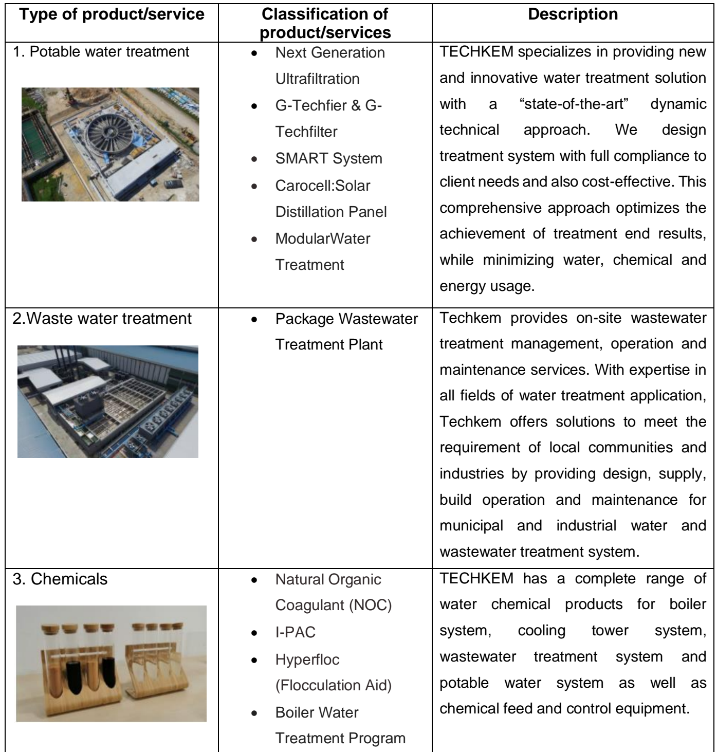
Table 2.1 Product / Service Provided by Techkem Water Sdn Bhd