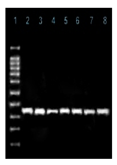
Figure 3: Amplification on 2.0 % (w/v) agarose gel stained with ethidium bromide showing: Lane 1: 100bp of ladder, lane 2: Positive control (ATCC 4157) Lane 3, 4, 5, 6, 7 and 8: positive bands of samples A1, A3, A5, A1, A2 and A5 with amplified products at 309 bp.

Six out of 10 samples of chicken bishop noses were positive for E. coli using both conventional and PCR based methods. Optimization of the cycling conditions using gradient PCR revealed 64°C to be the most optimum annealing temperature. All the 6 positive amplified products revealed a single band at 309 bp (Figure 3).