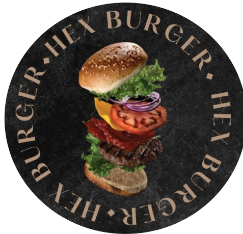
Diagram 1 : HEX Burger Logo