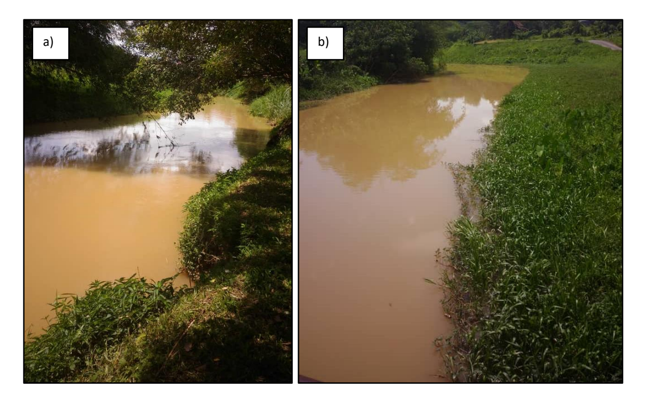
Figure 1. a) Station 1, and b) station 2 of Sg. Muar, Kuala Pilah