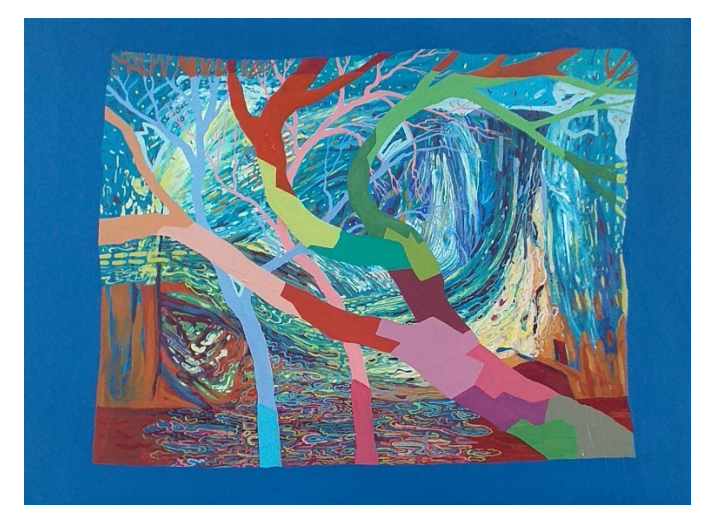
Figure 3: Artwork by Zainon Abdullah, Tari Rimba: Covid-19 Tsunami Senyap (2020), Acrylic on Canvas, 70 x 92cm