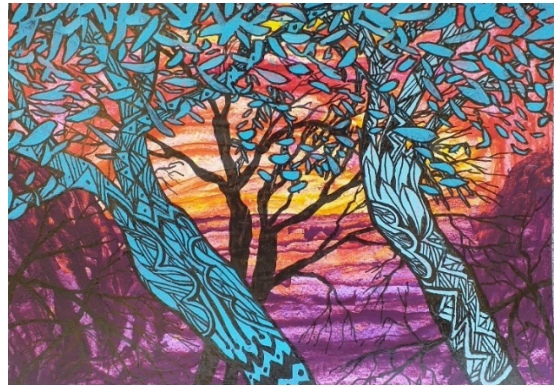
Figure 10: Artwork by Zainon Abdullah, Tari Rimba: Angin Covid 19- Sinar Harapan 1 (2020), Ink and acrylic on paper, 42 x 29.5cm

works entitled Tari Rimba: Angin Covid 19- Sinar Harapan 1, Tari Rimba: Angin Covid 19- Sinar Harapan 2, Tari Rimba: Angin Covid 19- Sinar Harapan 6, Tari Rimba: Angin Covid 19- Sinar Harapan 8, dan Tari Rimba: Angin Covid 19- Sinar Harapan 9. In these paintings, the artist has simplified the trees into abstract images. Furthermore, the image of the leaves is simplified to be oval so that it looks calm and not cluttered. The leaves are depicted as floating since they contain oxygen for humans. In the image of the main tree trunk, the artist summarized the image with endless lines to show the features of repetitive dhikr chants by enhancing small units of endless lines.