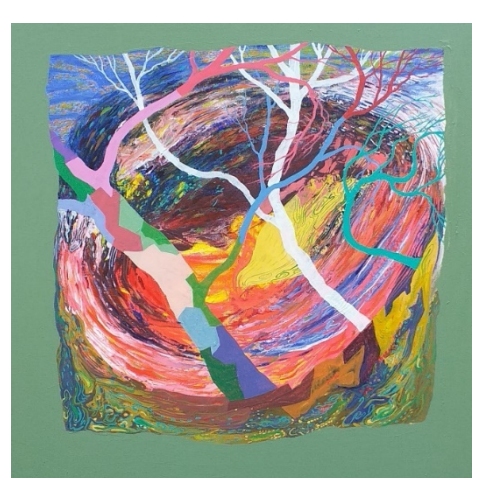
Figure 2: Artwork by Zainon Abdullah, Tari Rimba: Covid 19- Dunia Seperti Terjungkit (2020), Acrylic on Canvas, 70 x 70cm

The artist also thinks that the pandemic is like a silent tsunami. Looking back, the impact of the tsunami is very grave whereby many lives were lost as well as properties and belongings, as with the pandemic that took many lives in a short period. Tari Rimba: Covid-19 Tsunami Senyap (2020) is the artist interpretation of the silent tsunami. The border in this painting was not planned. The artist expressed his emotion of being in entrapment and panic state of MCO at the time of production. During the MCO period, the nation is in lockdown and everyone is expected to stay at home. Only head of families are allowed to shop for groceries and supplies.