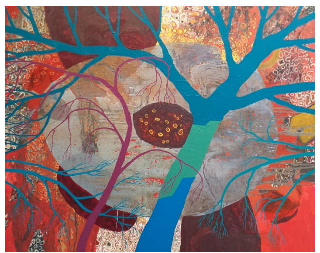
Figure 4: Artwork by Zainon Abdullah, Tari Rimba: Corona Datang Bersama Pintu Taubat (2020), Acrylic on Canvas, 134 x 109cm

Faced with the tragedy of the pandemic, the artist took a self-reflective approach. He added how many do not expect the whole world in lockdown. This shows the power of God as the owner of this earth. Tari Rimba: Corona Datang Bersama Pintu Taubat (2020) and Tari Rimba: Covid 19- Ya Allah Ampuni Kami (2020) is an expression of the artist's feelings of getting closer to the Almighty Creator. Expressions of the artist's consciousness are translated in a work entitled Tari Rimba: Covid 19- Ya Allah Allah Ampuni Kami (2020) by producing a subjective and mysterious landscape. The role of the red and orange colors expressed in this painting reminds us of the plague that befell mankind. Fear of this pandemic plague creates a sense of repentance. This work evokes feelings of fear, tragedy and mystery which have similarities in Edvard Munch's work, The Scream in 1983.