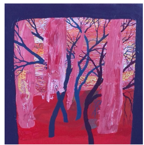
Figure 5: Artwork by Zainon Abdullah, Tari Rimba: Covid 19- Ya Allah Ampuni Kami (2020), Acrylic on Canvas, 38 x 38cm