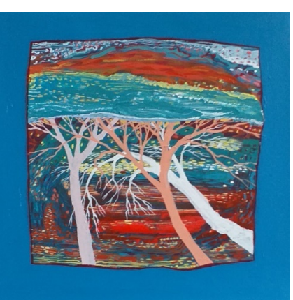
Figure 7: Artwork by Zainon Abdullah, Tari Rimba: covid 19. Terbelenggu (2020), Acrylic on Canvas, 38 x 38cm

spirited are translated visually with the resulting of the "framed border" image in these works. This frame carries a sense of not being free and confined while going through the pandemic situation.