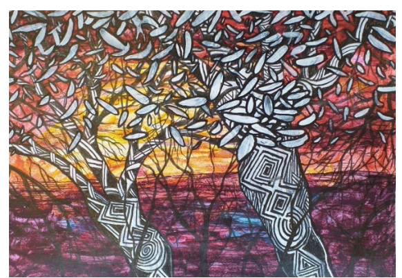
Figure 11: Artwork by Zainon Abdullah, Tari Rimba: Angin Covid 19- Sinar Harapan 2 (2020), Ink and acrylic on paper, 42 x 29.5cm