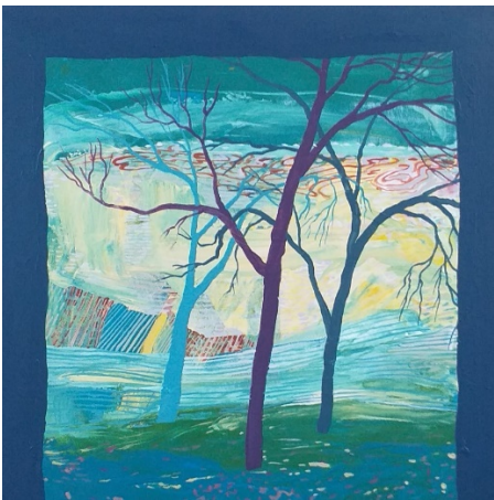
Figure 6: Artwork by Zainon Abdullah, Tari Rimba: Kesunyian Dek Corona (2020), Acrylic on Canvas, 38 x 38cm

With every misfortune that occurs, there must be wisdom behind it. The artist has also translated the wisdom behind the coronavirus pandemic in his work entitled Tari Rimba: Kesunyian Dek Corona (2020). The artist states the expression of calmness with the use of cool colors such as blue and green, which gave birth to a sense of peace and the use of horizontal lines reflect calmness. This can be attributed to the impact of this disaster causing the quality of the environment to improve. When the government issued the MCO in which all activities including the industrial, tourism and services sectors are discontinued, decreased number of vehicles became one of the factors in the improvement of environmental quality. This improved air quality can be seen in the blue and clean colors of the clouds like the colors used in the artist's painting.