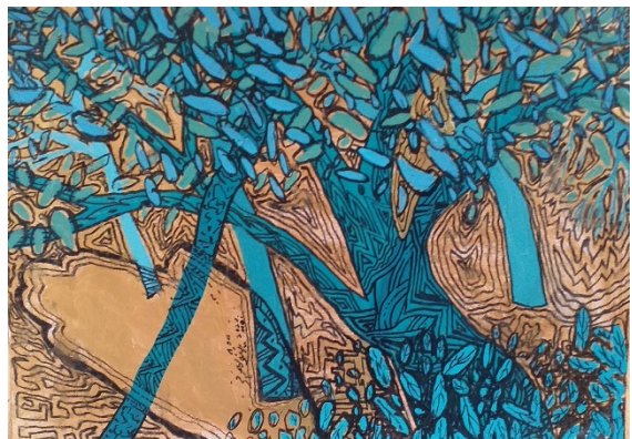
Figure 14: Artwork by Zainon Abdullah, Tari Rimba: Angin Covid 19- Sinar Harapan 6 (2020), Ink and acrylic on paper, 42 x 29.5cm