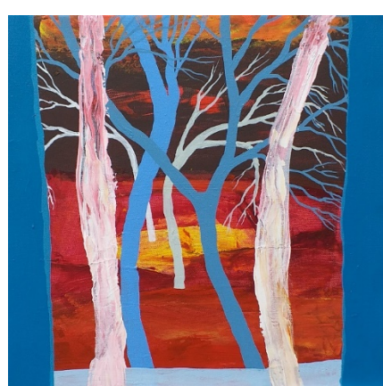
Figure 9: Artwork by Zainon Abdullah, Tari Rimba: covid 19- Langit masih suram (2020), Acrylic on Canvas, 38 x 38cm

Figure 8: Artwork by Zainon Abdullah, Tari Rimba: terkurung (2020), Acrylic on Canvas, 70 x 70cm