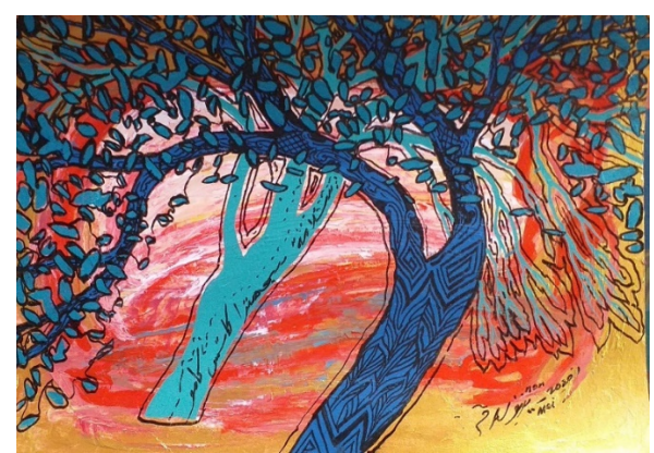
Figure 12: Artwork by Zainon Abdullah, Tari Rimba: Angin Covid 19- Sinar Harapan 8 (2020), Ink and acrylic on paper, 42 x 29.5cm