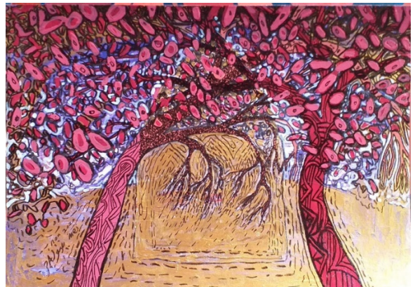
Figure 13: Artwork by Zainon Abdullah, Tari Rimba: Angin Covid 19- Sinar Harapan 9 (2020), Ink and acrylic on paper, 42 x 29.5cm