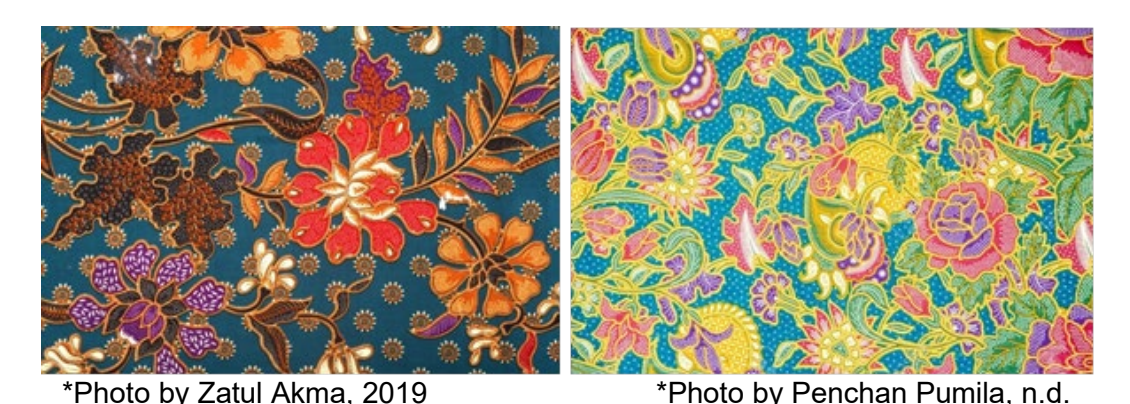
Figure 1: Leaves and flowers motif

The foremost prevalent motif are leaves and blooms. Malaysian batik portraying people or creatures are uncommon since Islam standards restrict creature pictures as enhancement. However, the butterfly subject may be a common exemption. The Malaysian batik is additionally famous for its geometrical plans, such as spirals. The strategy of Malaysian batik making is additionally very different from those of Indonesian Javanese batik, the design is bigger and less difficult, it rarely or never employments canting to form complex designs and depend intensely on brush portray strategy to apply colours on textures. The colours moreover tend to be lighter and more dynamic than profound coloured Javanese batik.