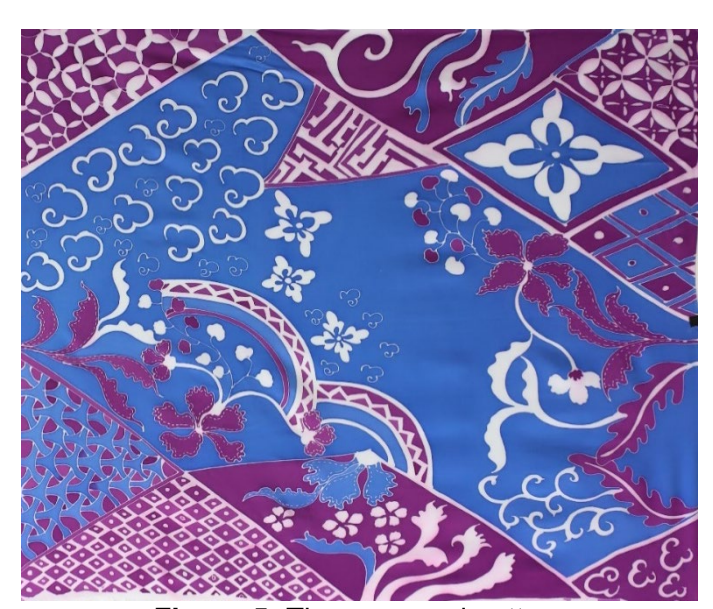
Figure 5: The proposed pattern

The idea is initially crafted by combining the motif from Malaysia Batik and Japanese textile and placing together in pattern composition to see its potential outcome. Based on the commonly used type of Batik motif (Table 1), type of Bingata motif (Table 2) and also visual analysis (Table 4), the iconic motif of both textiles is extracted to be embedded in the integration design. As in Batik motif, the iconic motifs are leaves and flowers and 'Pucuk Rebung' (bamboo shoots) while for Japanese textile the extracted iconic motif is 'Seigaiha Wave'. These iconic motifs are mix together in the proposed design (Figure 5) to create the new composition of pattern. The composed pattern then will be applied on the potential product of home décor as presented in the next section.