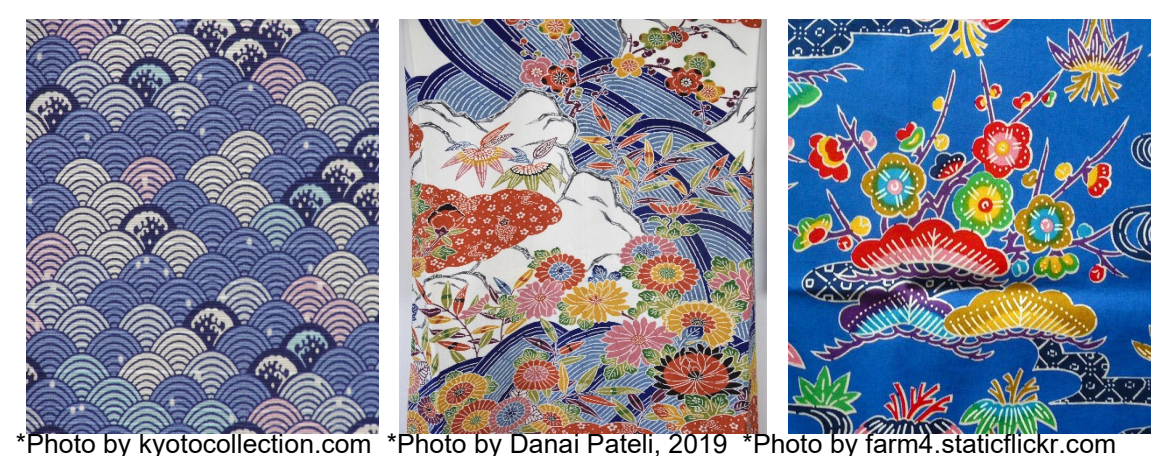
Figure 3: 'Seigaha Wave' motif furoshiki (traditional Japanese wrapping cloth)

The seigaiha or wave could be a design of layered concentric circles making curves, typical of waves or water and speaking to surges of great good fortune. It can moreover imply power and strength. The wave image or theme was initially utilized in China on antiquated maps to delineate the ocean. In Japan its most punctual appearance was on the clothing of a 6th century haniwa (funerary earthenware clay figure). It proceeded to be utilized as an image on clothing, especially kimonos, for over a thousand years. All through Japan's plan history it has been utilized on kimonos, ceramic product, lacquerware, then later in graphics design.