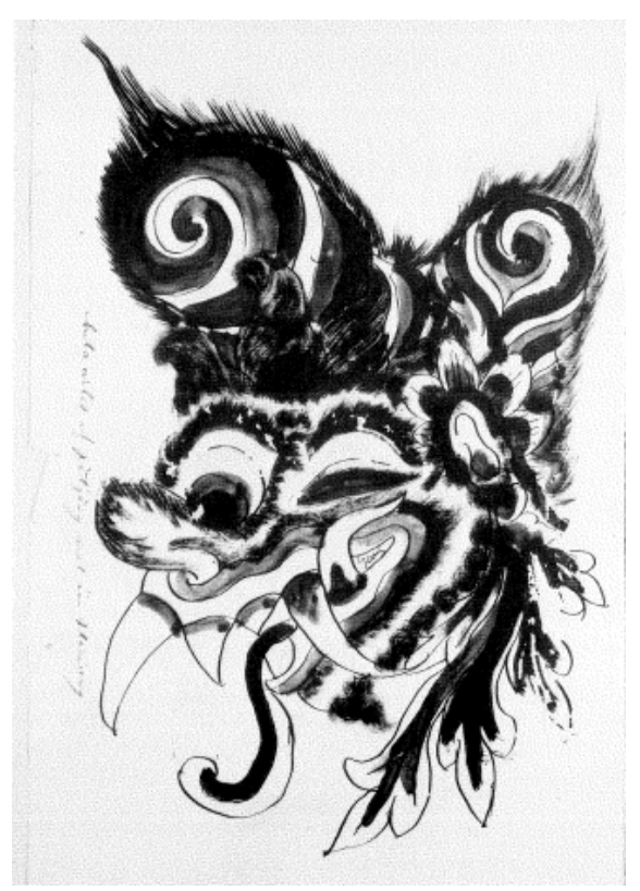
Figure 4: Ornament art is usually very decorative, made more spontaneous and expressive

The adaptation of modern art practices carried out by the North Balinese artists was not only done in their paintings, but was also shown in their shadow puppet performances. The puppeteer Banjar named Ida Putu Sweca (1898), made a bondresan or funny puppet figure out of existing classic puppet characters (Hinzler: 2013: 18). In terms of form, it does not follow the form of puppets in general, but more on personal creations with forms leaning towards cartoons. The puppet forms in the form of funny figures or servants are usually called punakawan . The shape of his creation is an imaginative form with a human-shaped horse head wearing full clothing and shoes. His creation was named Gede Baag (see Figure 5).