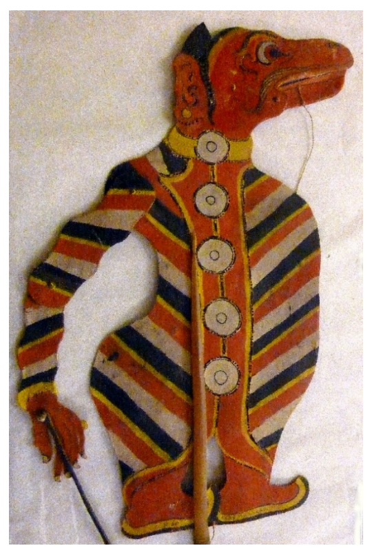
Figure 5: New cartoon figure (bondres) in puppet performance.