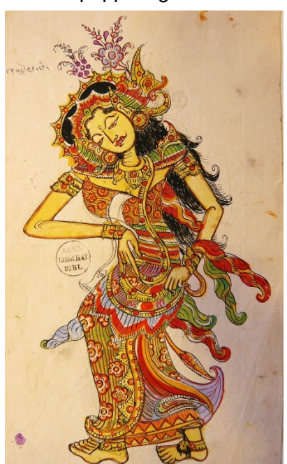
Single scene, there is only one puppet figure

One panel, there are several stories to connect, read from the bottom up