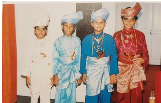
Figure 6 is a picture portraying four princes in full set customary clothes in different color code. They are during Istiadat Berkhatan; of YM Tunku Mohd Alauddin, YM Tunku Nasruan 'Adil, YM Tunku Nasaiuddin, YM Tengku Aslahuddin. They wore

Tengkolok dan destar terdiri daripada pelbagai jenis reka bentuk (bahan, teknik, reka corak/susun ikat) yang mempunyai makna dan dianugerahkan menurut status masing-masing. Bentuk tengkolok dengan lipatan yang bertingkat, Raja, lima lipatan, bendahara, empat lipatan, temenggung, tiga lipatan, dan orang kebanyakan satu ke tiga lipatan. Bentuk ikat kepala ini menjadi objek hiasan atau simbol estetik tetapi juga mempunyai simbolik dan dengan ciri makana konvensional dan intrisik. Satu peralatan budaya penting dalam adat istiadat penganugerahan (Siti Zainon, 2009).