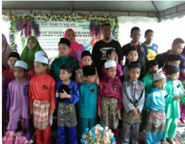
Figure 7 shows a group of boys who are prepared for the circumcised . they wore full set baju melayu cekak musang and teluk belanga in various color, matching with a songket sampung, and a head accessories of velvet black songkok or white keyatap, 2017.

Ciri khas yang dikekalkan ialah leher bulat yang disebut 'bulan-bulan', berjahit kemas dengan teknik 'tulang belut' atau 'tulang Peringgi', kancing satu berkocek (satu-wanita, dua – lelaki). Di Johor ia dikenali sebagai baju 'Kurang Johor Kancing satu', seperti salam ungkapan (Tenas Effendi 1945)