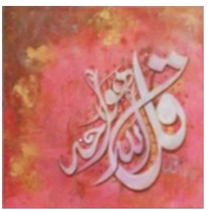
Figure 2. Title: Surah Al Ikhlas:1; Artist: Nor Azlin Hamidon; Medium: Mixed; Dimension: 40 x 40 cm; Year: 2015