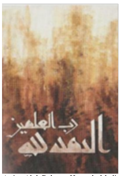
Figure 1. Title: Surah Al-Fātihah: 2; Artist: Abd. Rahman Hamzah; Medium: Acrylic; Dimension: 51 x 76 cm; Year: Unknown

"(Here is) a Book which We have sent down unto you, full of blessings, that they may mediate on its Signs, and that men of understanding may receive admonition."