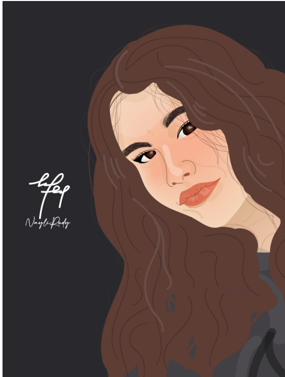
Digital Art Portrait