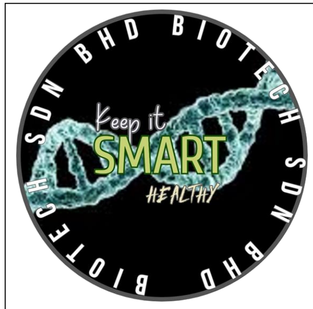
Figure 1: Company Logo

BioTech Sdn Bhd is a new registered corporation engaging in global health technology by offering a complete integrated solution for every global health problem from prevention and application of technology to prevent health problems from arising. Our products and services are generated from innovations that are developed continuously based on the global health needs by a reliable and professional team. We also provide comprehensive service locations in various regions in order to serve the best service for the community.