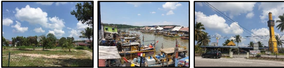
Figure 2: Snippets of scenery of Kuala Sepetang

This second parameter covers four aspects; open space, landscape, nodes and landmarks because they are commonly representing objects or places. Overall, Kuala Sepetang's strategic setting has influenced the arrangement or distribution of spaces. Because it is an old fishing village and used to have railway line, hence there is no proper open space and landscape found at the town centre. People can be seen spending their time with friends while having drinks and meals at the coffee shops and restaurants. Though this makes the centre seems full of people, however the absence of greenery has somehow made this area dull, grey and hot. While the intersection at Jalan Matang and Jalan Trump is regarded as nodes in the previous section 4.1, there is another area that can be pointed out as nodes, which is the riverside area where numbers of fishing boats anchored along the river. The existence of a bridge that connects the town centre to another village provides visitor a picturesque view of the river, mangrove and rows of fishing boats. As for landmark, two structures are regarded as landmarks namely Masjid Taufiqiah and the Port Weld sign. The minaret of Masjid Taufiqiah can be seen from distance, which gives a good point of reference for visitors who are not familiar with Kuala Sepetang. Even though the Port Weld sign is located smack in between shophouses, housing area and parking, nevertheless it is still regarded as a must visit spot among visitors because of its history.