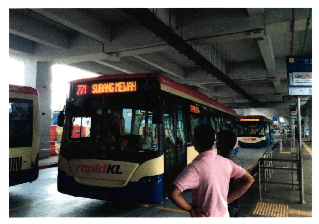
Rapid KL bus at Subang Jaya