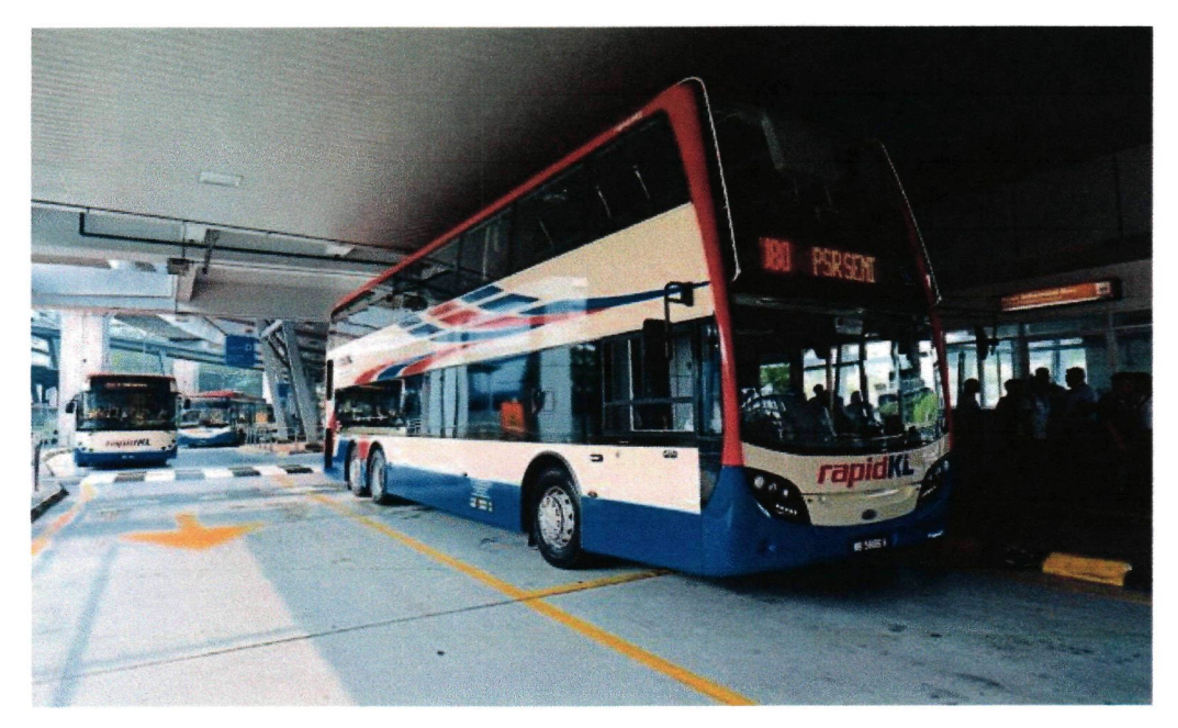
Rapid KL bus at Pasar Seni, Kuala Lumpur