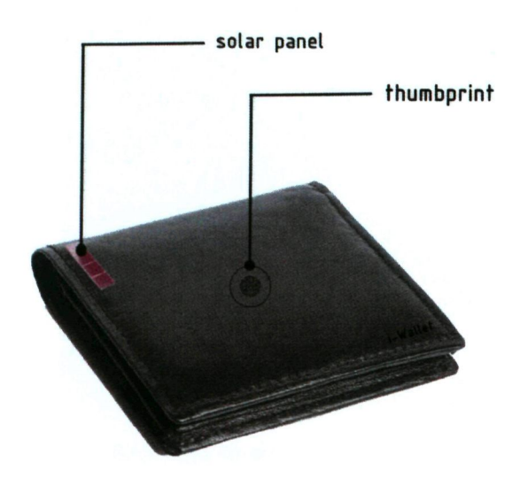
Front smart wallet function