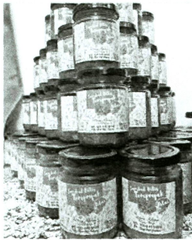
Sambal Bilis Tempoyak Petai