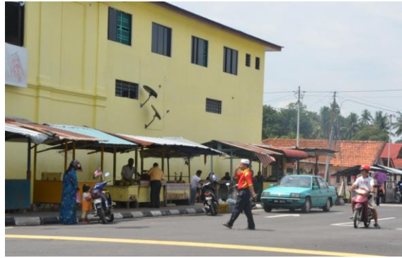
Figure 3 : Street vendors that create informal activities

Streets were public spaces, which served not only as connectors to various other localities within the town centre, but also acted as intermediate spaces connecting the fronts of one neighbour house to the other. In Pekan Parit, children played on the streets, while old folks would sit by the front of their houses chatting with neighbours. Even now most of these streets cater not only to vehicular movements, but are generally shared between pedestrians and other forms of street- centered activities. As we refer to Figure 3, from time to time certain traffic- pedestrian conflict creates discomfort toward its utilization. Therefore, crucial traffic control should help in enhancing human activities along the streets.