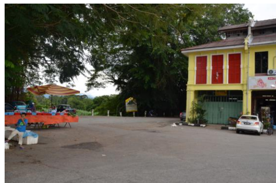
Figure 5: Abandon space that could become a connector to communal activities

Semi-nodal spaces are vacant spaces along the route or path or river within Pekan Parit. Most of these spaces are pocket spaces and are generally neglected or converted into parking spaces (Figure 5). They have the potential to be used as communal spaces within the town centre. The linear spaces, especially the back lanes, can be interlinked with these semi-nodal spaces to facilitate better utilization and connectivity.