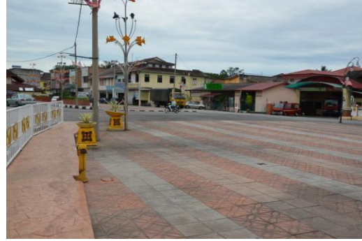
Figure 6: Vast nodal space has potential to inject a sense of robustness in the town centre.

These free-standing types of spaces offer opportunities to create organised public spaces within the Malay small town. They also have the potential to become important elements that provide robust and attractive spaces and activity venues to the people of Pekan Parit. One example of such space is located in front of Pekan Parit mosques that creates a sense of centralization and define the buildings around it. The robustness of this nodal space is crucial since it will implicate the activities around it and hopefully will generate vitality in the town center.