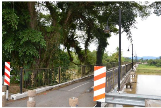
Figure 4: Linear spaces related to Perak river which can be a potential recreational space for the community.