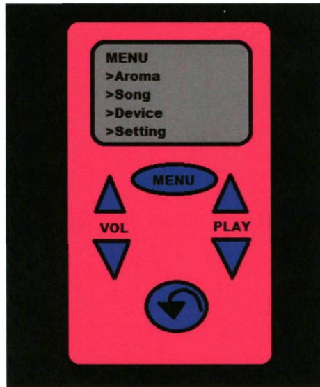
FIGURE 2: REMOTE CONTROL