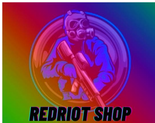
Figure: 1.2 Redriot Shop Official Logo

Redriot Shop is a name that is the name that has been chosen by us in the majority and inspired by the game development name which is called as Riot Company and the name is used as the backbone of our product. Our business Motto is “BEST OF THE BEST” which is show that our jersey is the best quality sale for our beloved customer with verity design especially with the E-sport theme jersey. As for our target market, Redriot Shop is target for all teenager and above with range 16-55 years old as our target sale which is suitable for the person who like the gamer or stylish shirt.