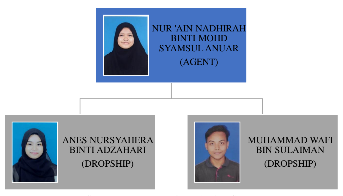
Chart 1: Mamasabya Organization Chart

This is my business organization chart that include my two dropships under me.