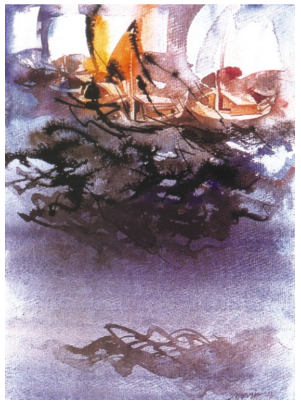
Plate 2: Boats and River, Water Colour, 110x90cm, 1998 From https://archive.thedailystar.net/magazine/2010/12/01/art.htm

Country boat is one in all of the commonly used water transportations in inland water transport, and fishes were another source of income for people in Bangladesh, Hashem Khan has reconstructed boats and fishes in his canvases. He was also the follower of folk art in Bangladesh. He has reconstructed the varieties of bird in folk motifs (Osman, 2000, p.113).