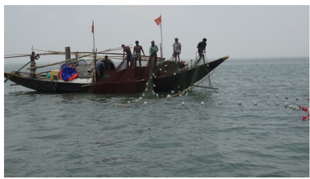
Plate 4: From https://www.dhakatribune.com/bangladesh/rules-and-regulations/2019/09/08/22-day-ban-on-ilish-fishing-from-october-9

Bangladesh, with its rich inland waters and river systems, has significant fishery and aquaculture potential. The favorable geographic position of Bangladesh comes with a large number of aquatic species and provides plenty of resources to support fisheries potential. Fish is a popular complement to rice in the national diet, giving rise to the adage Maache-Bhate Bangali ("a Bengali is made of fish and rice") (Shamsuzzaman et al., 2017).