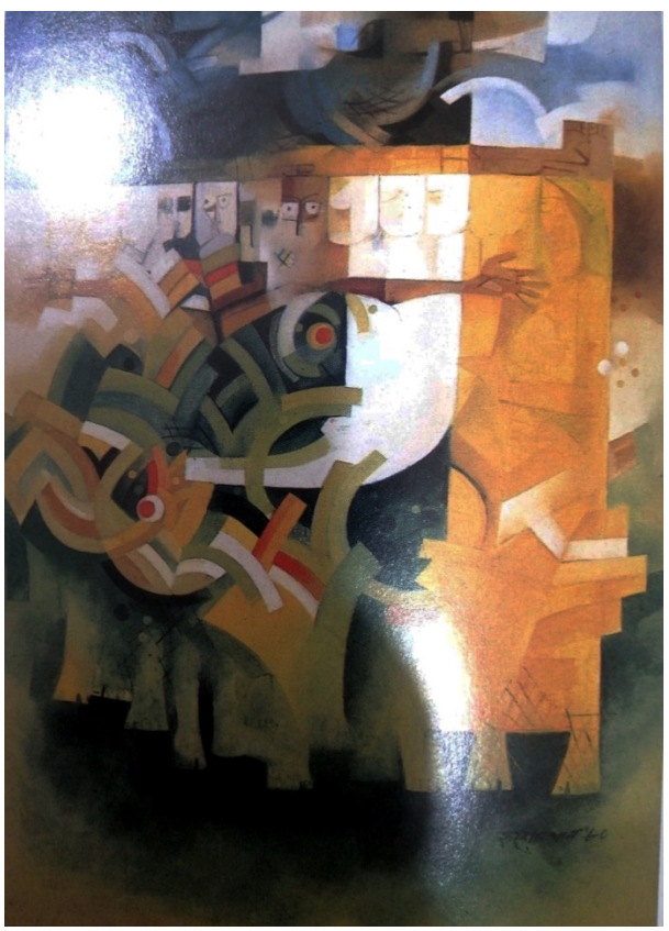
Plate 1: Rickshaw-8, Oil on Canvas, 120 cm x90 cm, 1981 From Hashem Khan, Contemporary Art Series of Bangladesh-4. (1992) Dhaka: Bangladesh Shilpokala Academy.

In 70s and 80s, Khan did a series on plate, rickshaw, fish etc. These are considered so common objects that no painter ever thought of them as proper objects to paint. They are not merely insignificant objects, for there are political perceptions on them. In his childhood, he saw poor villagers and hungry people whose only dream is to have three-time meal. Thus, a plate is not only a mere container to him, but it is the dream of voluminous starving people (Mamoon, 2000, p. 121).