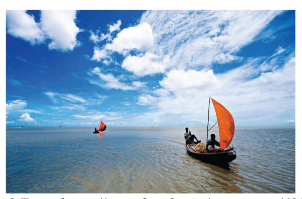
Plate: 3

Country boat is one in all of the commonly used water transportations in inland water transport, and fishes were another source of income for people in Bangladesh, Hashem Khan has reconstructed boats and fishes in his canvases. He was also the follower of folk art in Bangladesh. He has reconstructed the varieties of bird in folk motifs (Osman, 2000, p.113).