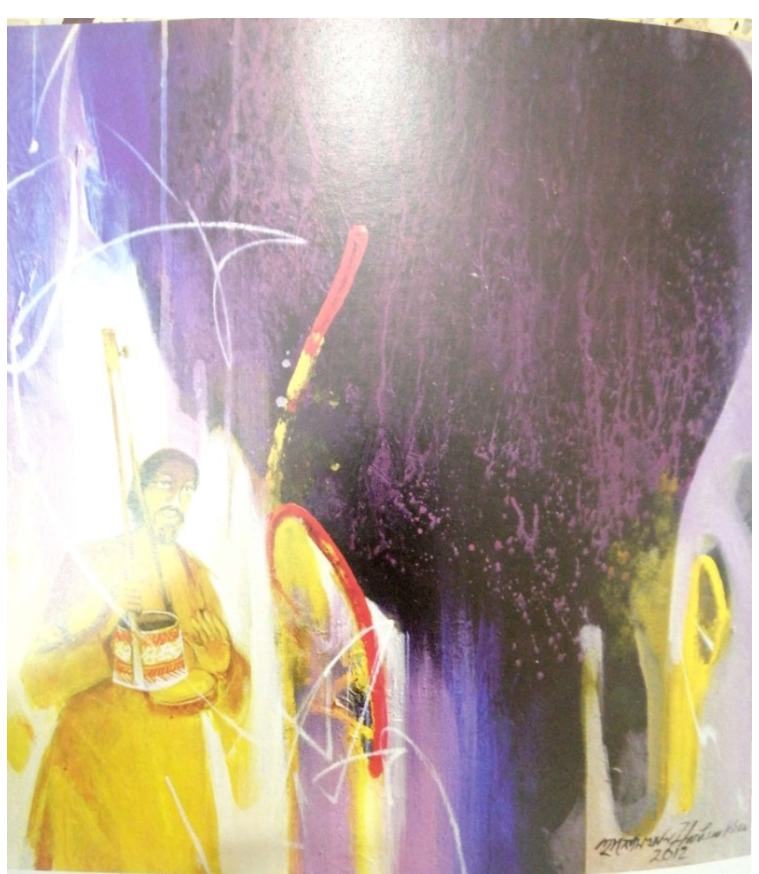
Plate 6: Acrylic on Paper, 61cm x61 cm, 2012 From Mamoon, M. (ED.), (2000) Hashem Khan , Dhaka: Bangladesh Shilpokala Academy.

In this painting, Khan has used modest usages of symbolism. The painted pot is a traditional symbol for Bengali. The fishes and net are depicted as the prosperous and simplified lifestyle of common Bangladeshi people.