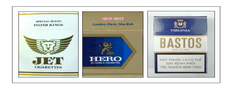
Figure 4: Images of top three most popular cigarette brands The Conditional Logit Model

There are three utility functions, each representing the utility generated by one of the three options, where V_j is the utility function associated with alternative j. ASC is defined as the alternative specific constant of the model, and it captures the mean of unobserved factors in the error teams for each alternative: