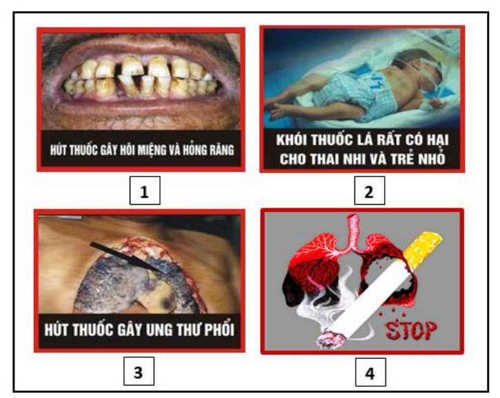
Figure 1: Graphic images were used in choice experiment Note: (1) Graphic image of damaged teeth; (2) Graphic image of sick neonate; (3) Graphic image of lung damage; and (4) Graphic image of abstract damage.

The choice experiment (CE) method was used to capture the potential impacts of warning information on smoking control policies. The CE technique was first developed by Louviere and Hensher (1982), then applied widely in many fields such as marketing, transportation and tourism (Carson et al. , 1995; Morrison et al. , 1997). CE technique is based on Random Utility Theory of Lancaster, wherein individuals are asked to make a number of choices among products or services. Each product or service is defined by their attributes at different levels (Lancaster, 1996). From April 2018 to June 2018, a choice experiment (CE) was conducted in Can Tho city – the largest city in the Vietnamese Mekong Delta. We performed a choice experiment among 120 adult smokers surveyed using questionnaires. In this study, product attributes and their corresponding levels (see Table 1) were selected based on the basis of a literature review (Goto et al. , 2011; Czoli et al. , 2017; Regmi et al. , 2017).