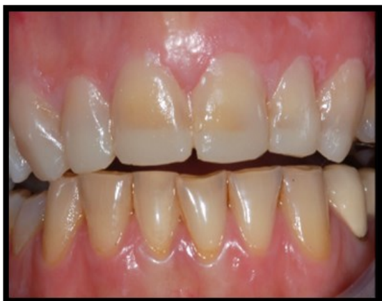
Figure 6: Intra-oral mock-up

Figure 3 – 6. Investigations for the management of tooth wear patients