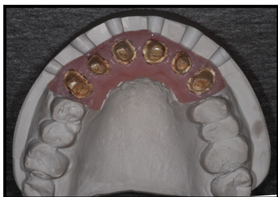
Figure 16: Working cast ready for fabrication of the full ceramic crowns (6 anterior teeth)