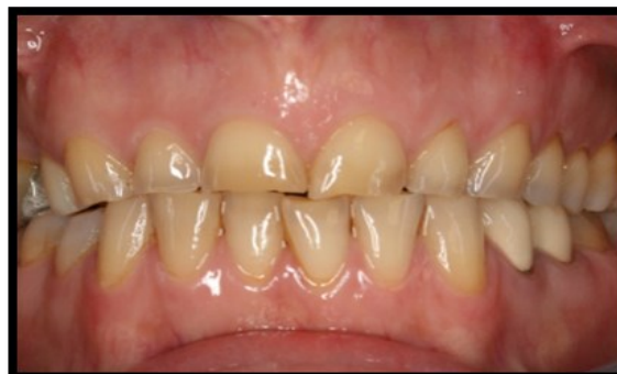
Figure 1: Short and yellowish appearance of the anterior teeth

The diagnosed aetiology of the tooth wear was erosion with an element of attrition as a consequence to the softened tooth structure due to high intake of acidic food.