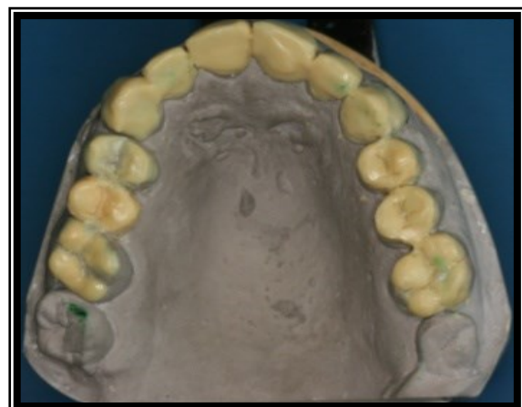
Figure 5: Diagnostic wax-up