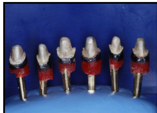
Figure 14: Trimmed individual silver dies