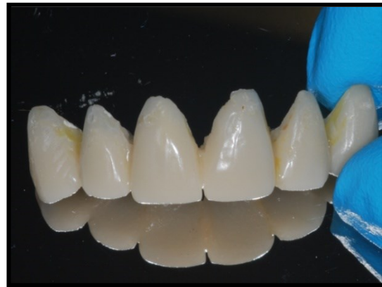
Figure 13: Laboratory made provisionals