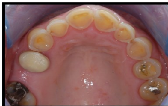
Figure 2: Moderate to severe erosion of the palatal surfaces