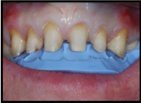
Figure 9: Preparations guided by silicone index from diagnostic wax-up

coincides with RAP and canine guidance occlusion was provided. Patient was reviewed 2 weeks later and she reported no discomfort on the TMJ and had adapted well to the increased OVD. Phonetics was also satisfactory.