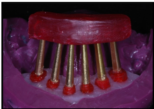
Figure 15: Soft tissue mask applied prior cast pouring