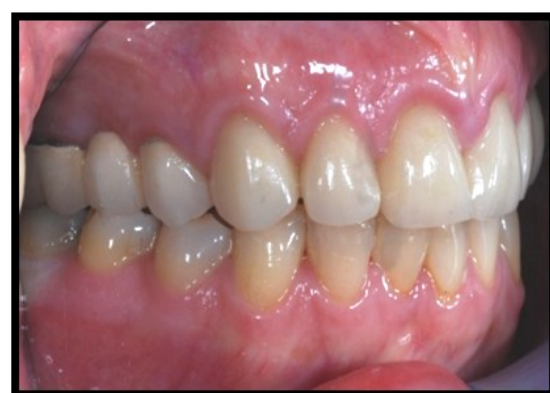
Buccal view (Right side)