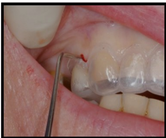
Figure 7: Incision level marked with surgical stent from diagnostic wax-up

A silicone index (Fig. 9) fabricated from the diagnostic wax-up used as a guide to tooth