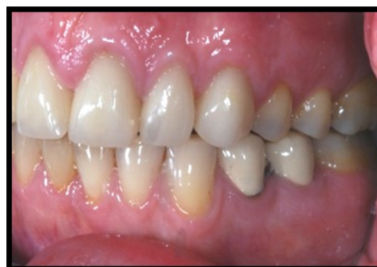
Buccal view (Left side)

Once the all-ceramic crowns were ready (13, 12,11, 21, 22 and 23), try-in was done intra-orally for adjustment and finishing stage. The fitting surface was treated (9.6% HF followed by post-etching cleaning with phosphoric acid and silane added) prior cementation with resin luting cement under rubber dam. For the 14-16 metal-ceramic bridge, try in done and cemented with glass ionomer cements.