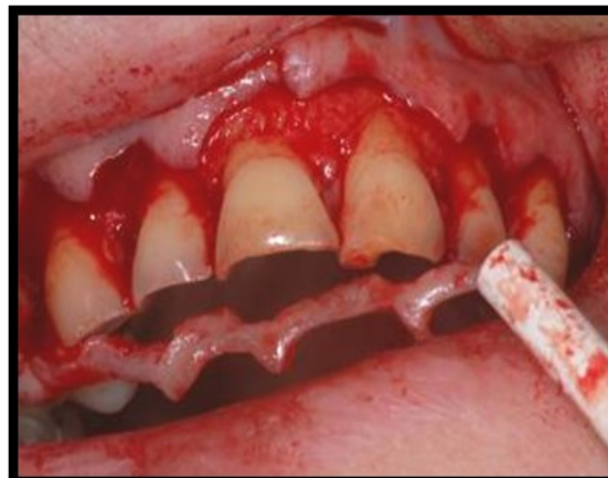
Figure 8: Removal of soft tissue and alveolar bone recontouring

Figure 7 – 8: Procedure on crown lengthening