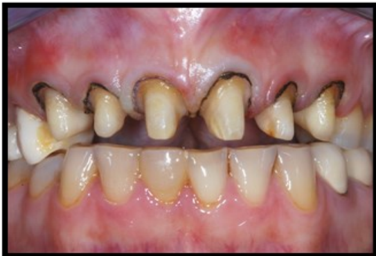
Figure 10: Gingival retraction to refine margin preparations