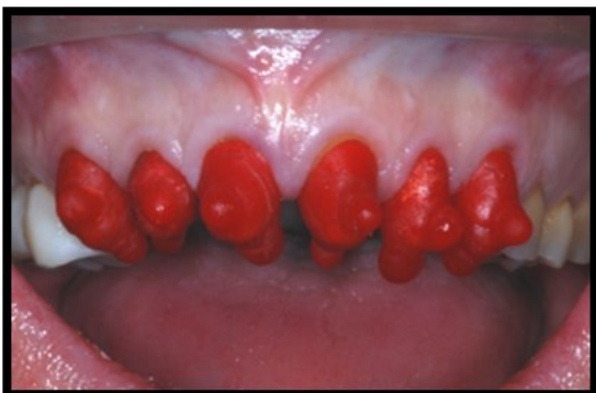
Figure 11: DuraLay resin coping try-in