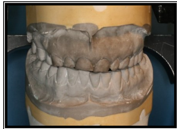
Figure 4: Articulated study casts