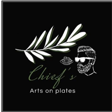
Figure 3 : The Logo of The Chief's Restaurant