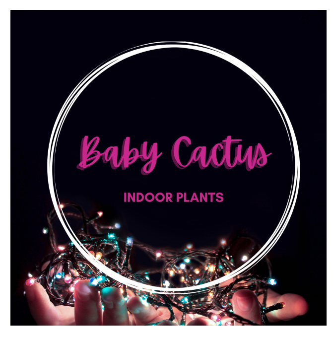
Figure 1.1: Logo of Baby Cactus

For the target market baby cactus is more for all teenagers and above with range 13 – 55 years old. This is because teenagers are more attracted to things that are cheap and easy to care for. To anyone who wants a simple and easy-to-care plant can get in our store which is a Baby Cactus located in Pasar Minggu Tapak Tamu, Blok 1 No.04, Beaufort 89800, Sabah.