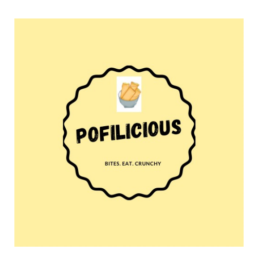
Figure 1: Logo of Pofilicious

The name of POFILICIOUS described as the name of my name and the name of this food in Malay which is called as "popia". My purpose by choosing the name is because I would like to sell one of my favourite foods that will be an easier to make this kind of "popia". By using a part of my name into company will make it looks authentic and easier for people to remember and pronounce it.