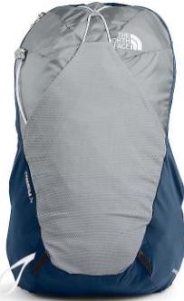
WOMEN'S CHIMERA 24 BACKPACK