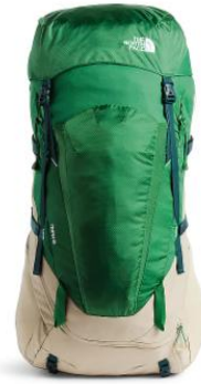
TERRA 65 BACKPACK