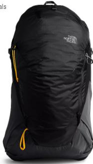
HYDRA 26 BACKPACK