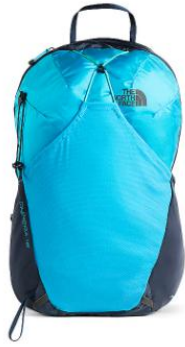
WOMEN'S CHIMERA 18 BACKPACK