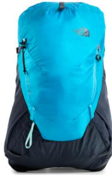
WOMEN'S HYDRA 26 BACKPACK