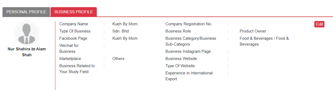
Figure 2: E-Commerce Registration