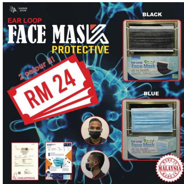
Ear Loop Facemask