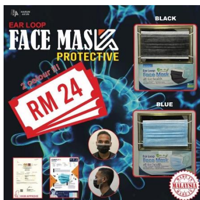
Earloop all colour Rm 24