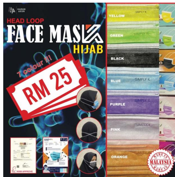
Head loop facemask

For the head loop facemask by Simply K is suitable for women that wearing hijab because the rope of facemask is designed for women that wear hijab but men also can wear this facemask and for ear loop facemask it is suitable for men and women who wear hijab that still want to wear this ear loop facemask must wear extension mask.