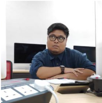
Owner of MG Perfume Your Scent