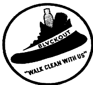
Figure 1 Company Trademark Logo