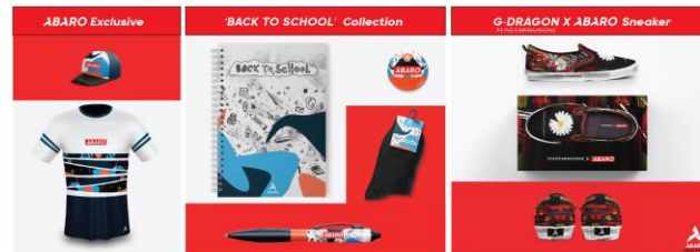
Other collateral items