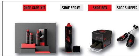
Signage and other collateral items