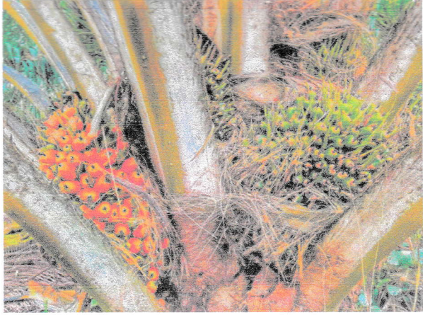
Hybrid Species of Oil Palm