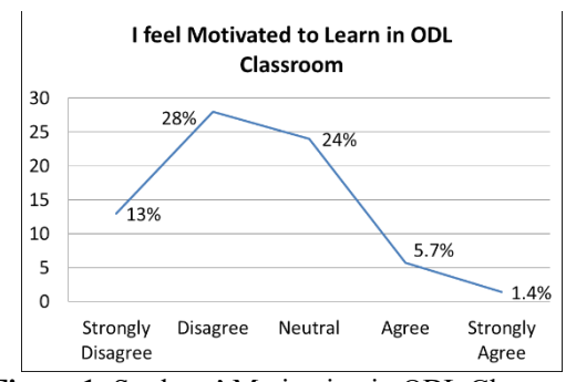
Figure 1: Students' Motivation in ODL Classroom

The questionnaire was designed to capture students' views of ODL implementation in UiTM, particularly among students from the Faculty of Computer and Mathematical Sciences (FSKM), Universiti Teknologi MARA Kelantan branch, Machang Campus. A five-point Likert scale was utilised with the value of 1 for strongly disagree and the value of 5 for strongly agree. It is imperative that the students understood the instructions clearly before answering the questionnaire.