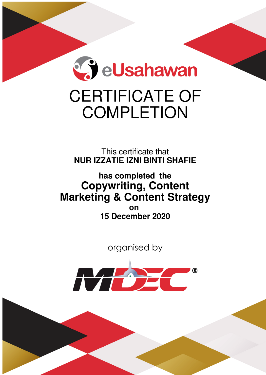
Figure 1.0: E-commerce certificate.