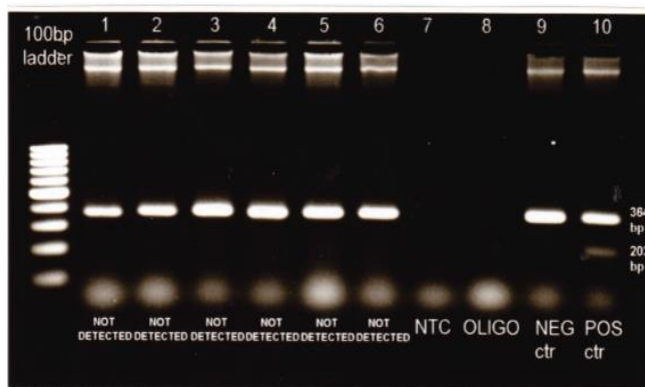
Figure 2 Allele-specific polymerase chain reaction (PCR) for the JAK2 V617F mutation. The 364-bp band serves as an internal control. The 203-bp band indicates the presence of the mutation. Lanes 1–6, samples; lane 7, PCR negative control with no DNA template; lane 8, OLIGO; lane 9, Negative control; lane 10, positive control.

*The normal range for Hb level in accordance to a study by Roshan et al., 2009.