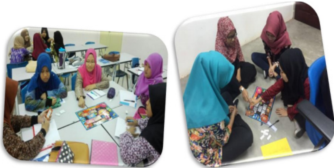
Figure 5: Students Playing The Grammar Buzz board game