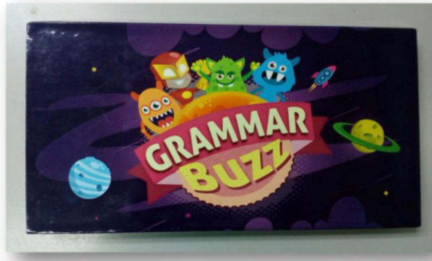
Figure 1 Grammar Buzz Box Design

There are vocabulary board games in the market but no board games on grammar. It is believed that Grammar Buzz has good potential for commercialization purposes. Games as instructional tools in grammar classes can improve students' ability in incorporating grammar knowledge in written and oral tests. The Grammar Buzz board game can increase students' language proficiency as they will have a chance to use the language in many situations required in the games.