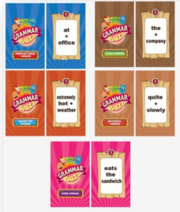
Figure 3: Grammar Buzz Cards