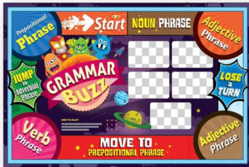
Figure 2: Grammar Buzz Board Design