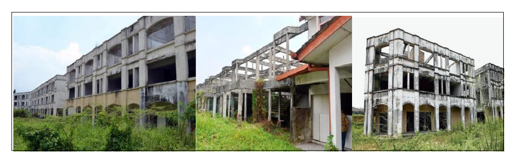
Figure 1: The Example of Brownfield Development Area

National Land-Use Database (NLUD, 2006) in England categorises the term brownfield as vacant previously developed land or buildings where under--used previously developed land or buildings allocated in the local plan or with planning permission or under--used previously developed land or buildings with redevelopment potential but no planning allocation or permission or derelict land and buildings (NLUD, 2006). While in Germany, Federal Environmental Agency has carried out pilot studies to characterise the term brownfield within Germany. Hamm & Walzer (2007) describes brownfield as two types of inner city buildings not under use and inner city areas for redevelopment and refurbishment.