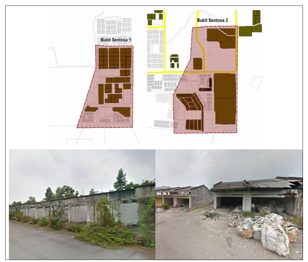
Figure 13: Brownfield Site in Bukir Sentosa 1 & 2, Hulu Selangor