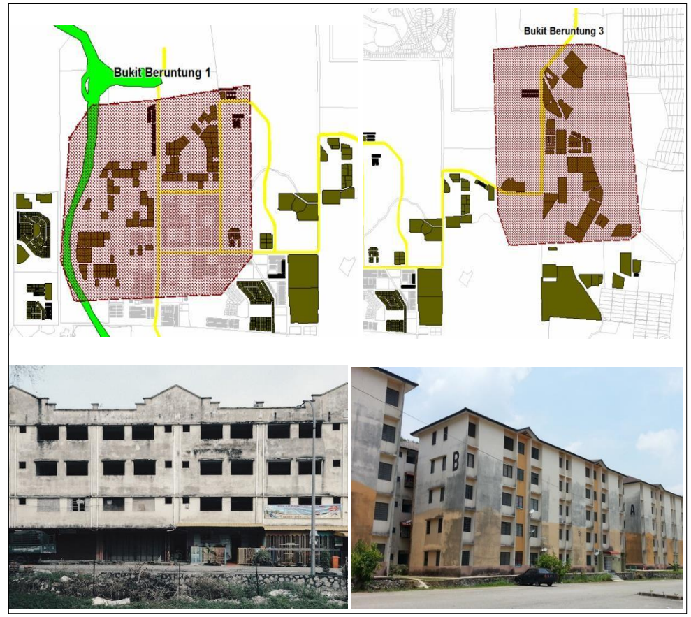
Figure 14 : Brownfield Site in Bukit Beruntung 1 & 3, Hulu Selangor