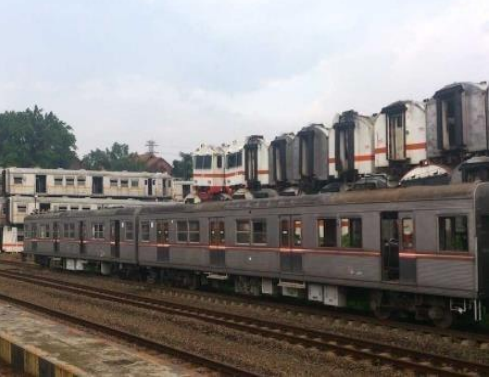
Figure 8: Category F of Brownfield