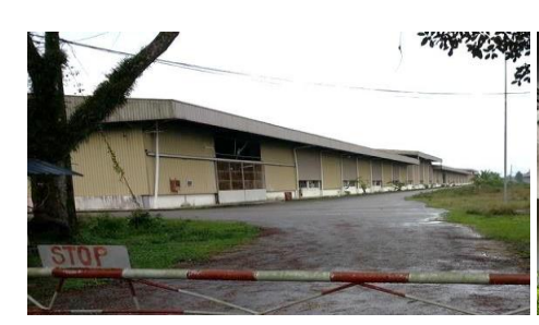
Figure 5: Category C of Brownfield