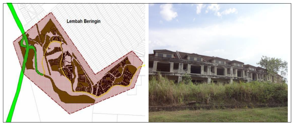
Figure 9 : Brownfield Site in Lembah Beringin (Study Area)