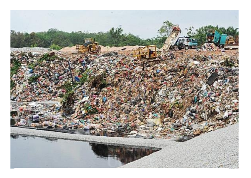
Figure 4: Category B of Brownfield