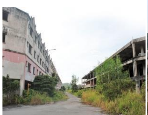
Figure 7: Category E of Brownfield