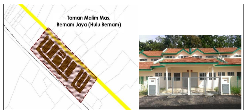
Figure 10 : Brownfield Site in Bernam Jaya (Hulu Bernam)