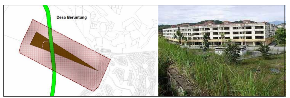
Figure 11 : Brownfield Site in Desa Beruntung, Hulu Selangor Source: Hulu Selangor District Local Plan, 2020