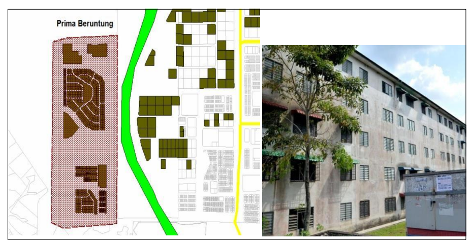
Figure 12 : Brownfield Site in Prima Beruntung, Hulu Selangor