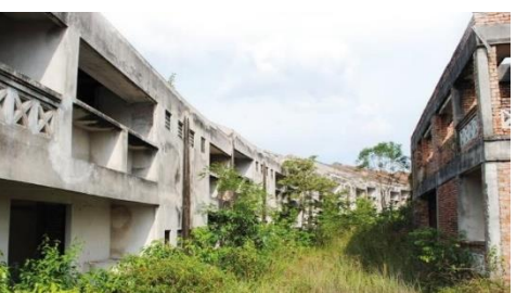
Figure 6: Category D of Brownfield